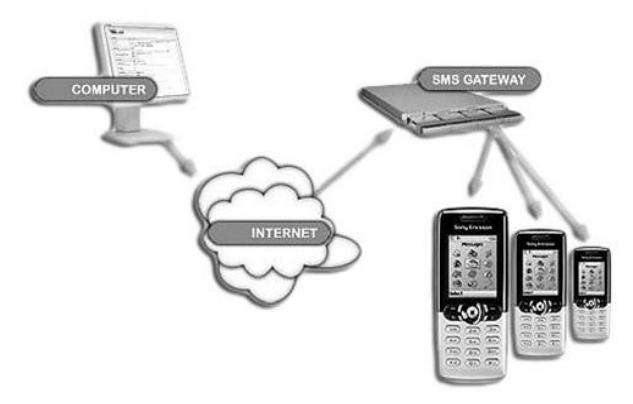
Figure.1: SMS Gateway system

So it will save our time and work faster and with less errors. We are using an API / GSM Modem for Telecommunication network. The procedure of SMS Gateway with API is coming about extraordinary upgrades with a significant solution for changing business sector all the time. Our attractive abilities of our telephone penetration and different gadgets have included the capacity of sending SMS in another way. It is our part and exceptionally not more viable answer for a wide range of business needs. It permits SMS instant messages to be sent by email. SMS through email-passage is not quite the same as SMS aggregators since they are introduced an association's own system and it ought to be associated with a neighborhood versatile system [1]. The SIM required association of the portable system is produced using the mobile operator and introducing it in the gateway.