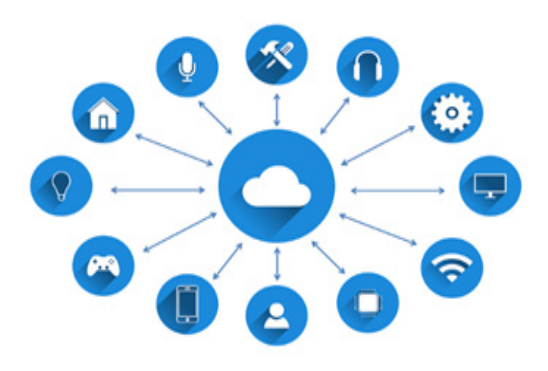
Fig.1:Internet of Things

The IoT (internet of things) is the network of things which are connected each other through internet. IoT now exists in every part of society. Smart homes, Smart wearable, Smart retail, Smart connected cars and some examples of internet of things. The inescapability of IoT facilitates some regular exercises, en-wealth how individuals collaborate with nature and environment, and enlarge our social communications with other individuals and articles. This comprehensive vision, in any case, raises likewise a few concerns, similar to which dimension of security the IoT could.