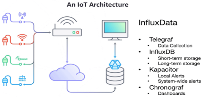
Figure 3.2 Influx DB